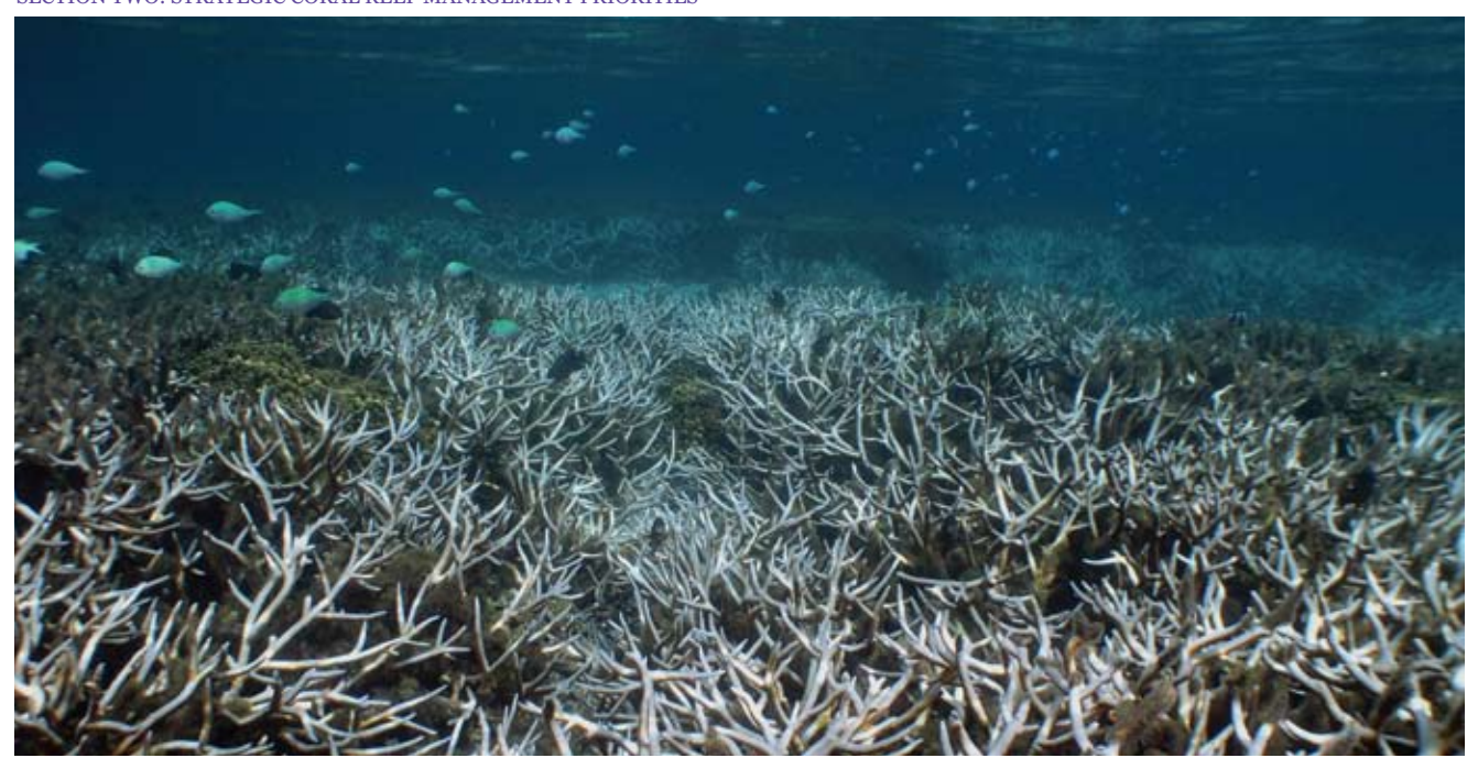
Bleached coral in the shallow waters of the Tumon Bay Marine Preserve.