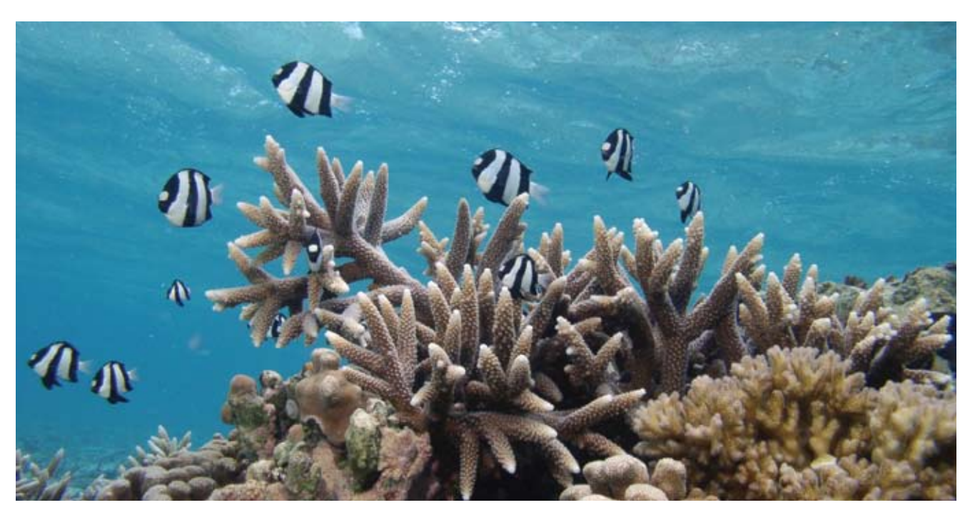
Healthy coral in the shallow waters of Guam.