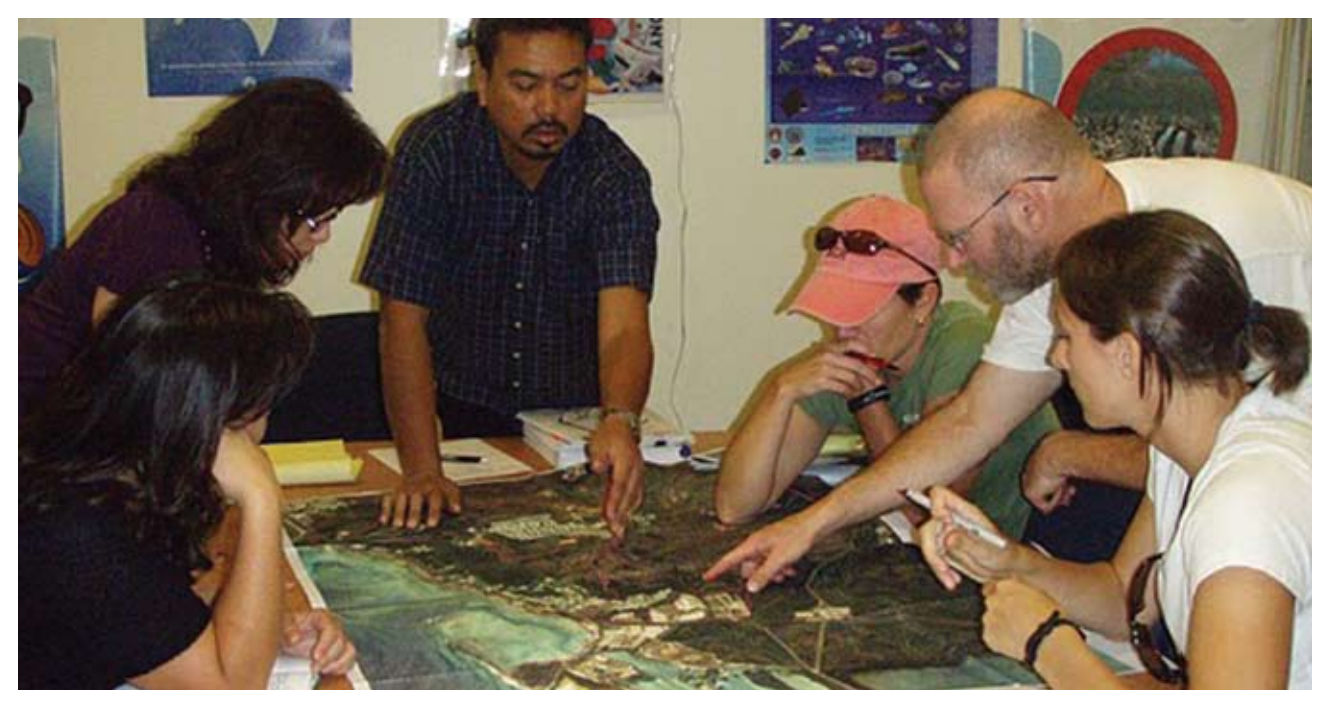
Scoping conducted to identify stormwater retrofit opportunities; stormwater management is a tool in managing runoff.