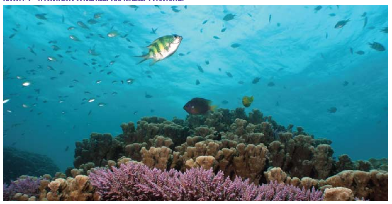
Resilient coral ecosystems are better able to recover from adverse impacts; Guam's objectives include addressing ecosystem resilience.

5.5 Quantify the extent of nuisance and invasive species affecting Guam's reefs and investigate and test management approaches.