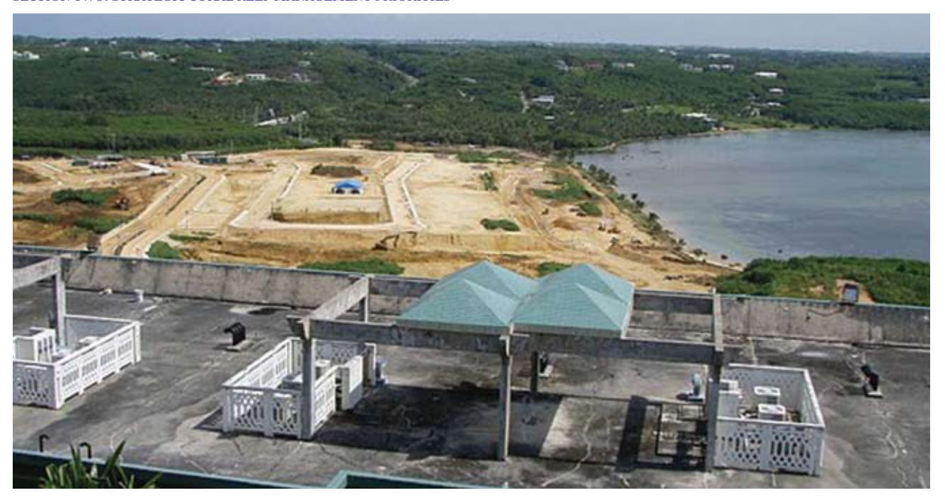
Development activities are increasing in anticipation of the military build-up in Guam. It is important that proper mitigation planning is set in place when impacts to coral ecosystems can not be avoided.

conservation actions surrounding wetlands and watershed management.