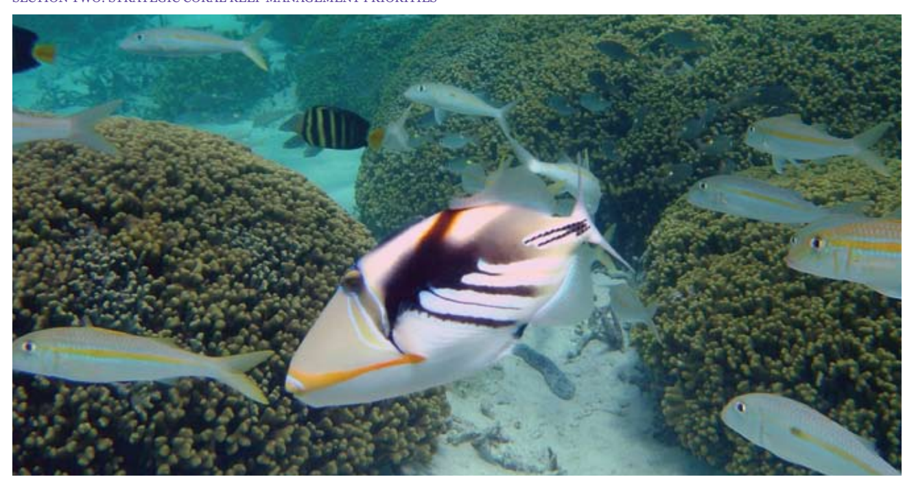
Healthy coral reefs provide important habitat for reef fish.