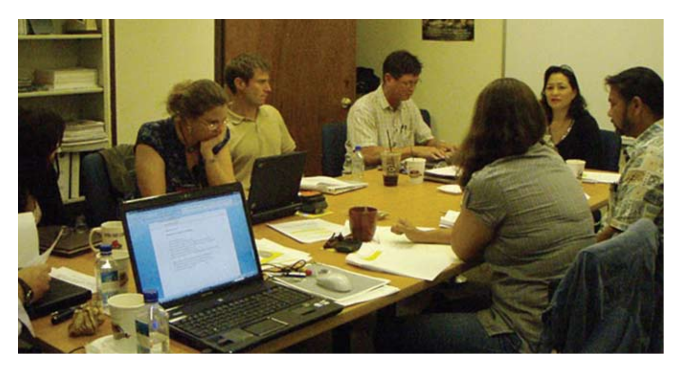
During the second day of the priority setting workshop, core managers met in small groups to identify specific actions to implement the agreed upon priority goals.