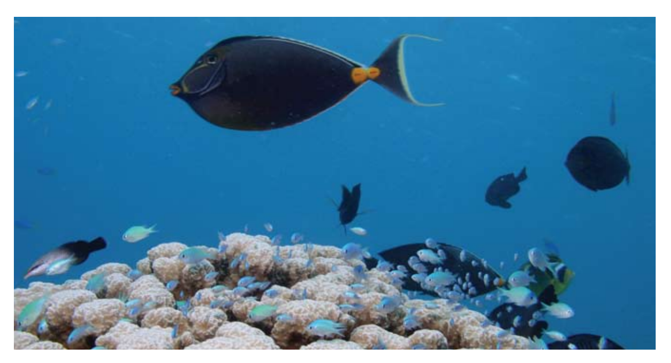
Marine preserves like Piti Bomb Holes Marine Preserve are proven fishery management tools that increase the size of reef fish within and surrounding their borders.

2.2 Create community management programs that increase public knowledge of, support for, and participation in marine preserves and science-based management.