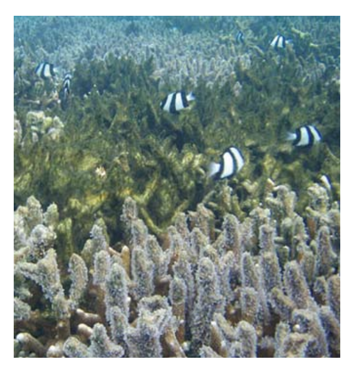
Left Image: A reef community near Anae Island, on the southwest coast of Guam, that is heavily impacted by regular sedimentation events. Right Image: Algae growth shown overgrowing coral may be associated with nutrient-rich runoff in Tumon Bay.